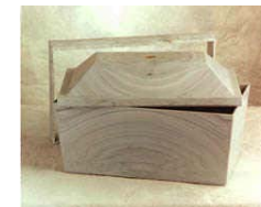
Hepburn Urn Vault