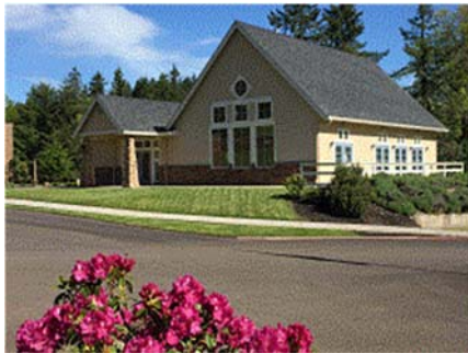
Sunset Hills Funeral Home