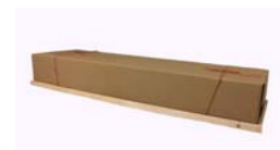
Alternative Cremation Container