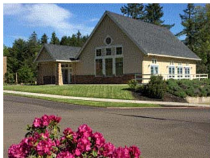
Sunset Hills Funeral Home