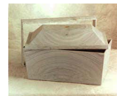
Hepburn Urn Vault